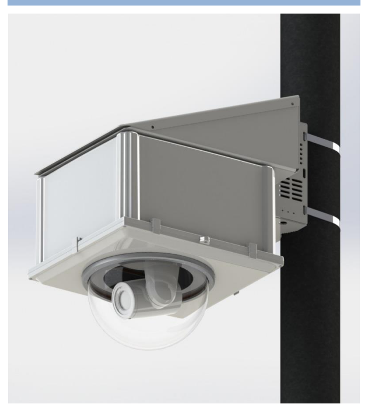
Pole Mounted HD12-CD-HB with example broadcast camera installed

Extended Temperature Range Configuration: HD12-CD-HB