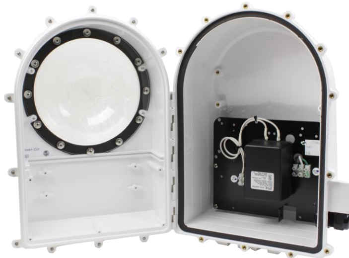
KT-24VAC: Example Installed into D2 Housing (Housings sold separately)

*Product specifications are subject to change without notice. Rev. 2.1