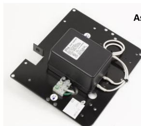
Assembled for D-Series Install