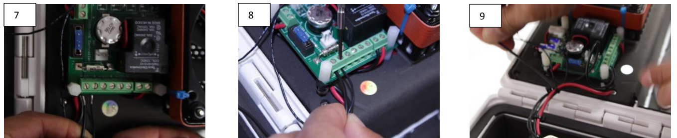
7-9) Install two heater wires are (non-polarity specific) to PCB terminals, but be sure one is on a (+) terminal, and other is a negative (-) terminal printed on PCB

6) Install provided four #6 hex Nuts on fan retainer studs, tighten gently with 5/16" nut driver..