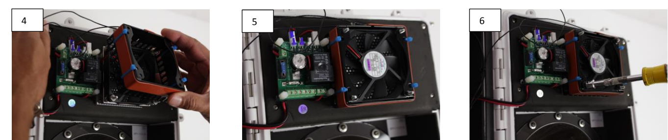
4 & 5) Install Heater Bracket over Cooler Cold Sink with wire leads from heater oriented to back of D2, and the four #6 threaded studs aligning with holes.

2 &3) Newer COOLDOME models have a Black Circuit Cover Bracket that must be removed. Remove four #6 nuts and remove cover to ready Heater install.