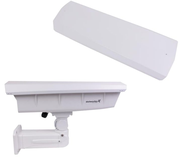
(S-Type Housing Sold Separately)