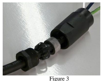
2) Feed Parts Over Round Weather-Rated Cable as Shown