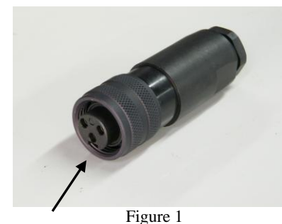
1) Note: Position of polarity Key in figure 1, positioned below Bottom pin for all of following views. This is nearest to ground pin.

Range for Round Cable Diameter: 0.39 - 0.54" (10 - 13.5 mm) SJ00T or Equivalent Recommended for Outdoor Use Contacts UL/CSA Rated to 9 amps, up to 600 V, 105 C