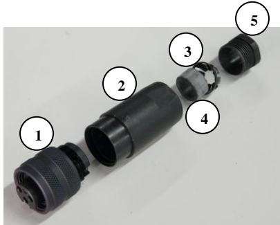
1) Plug Head w/ conductor screw terminal clamps