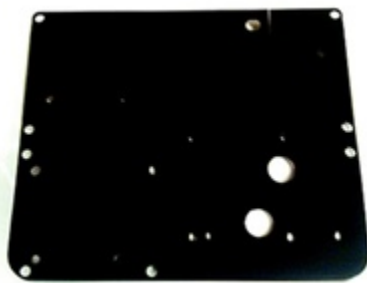
#8-32 Mounting Hardware

Internal Accessory Mounting Bracket (BR-ACC1), (1 unit) Regulated Step-Down Power Supply, Quick Connect Power Harness, Aluminum Mounting Stand-Offs, Nylon Circuit Board Stand offs, & Mounting Fasteners