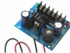
LV Power Supply

For Quick, Easy, & Convenient Mounting of Accessories into D-Series Enclosure: Power Supply & Power Harness Pre-Installed on bracket Install as shown in example below, using provided standoffs and fasteners inside Dotworkz D-Series Enclosure: